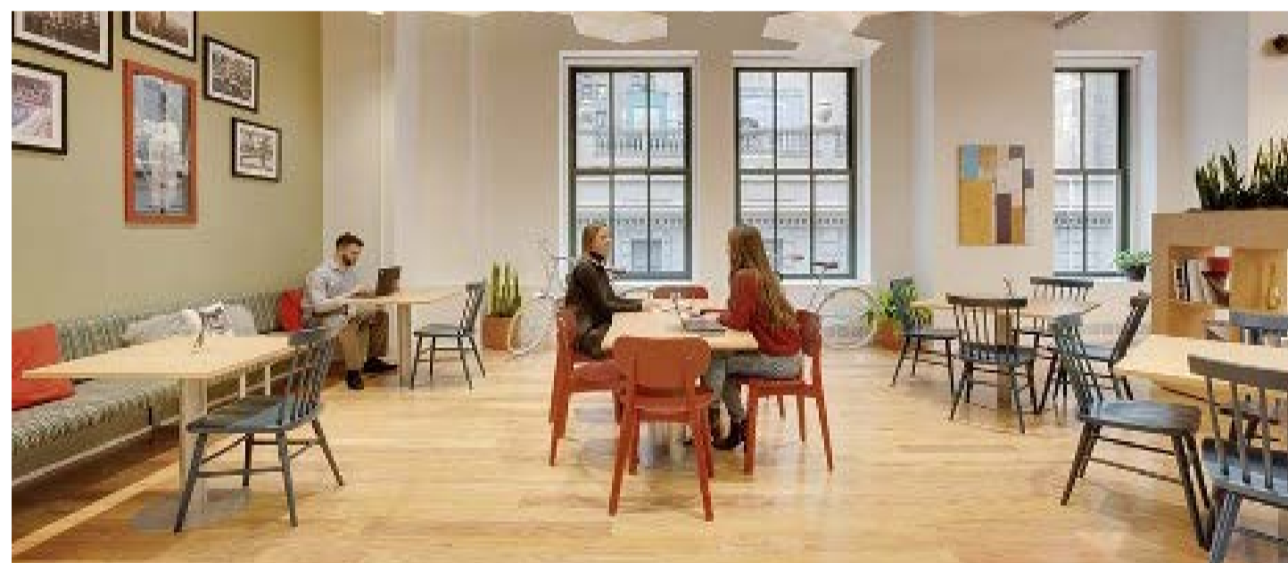
230 Park Avenue

This project included a large suite renovation of a high-end prebuilt space. The build out features glass office fronts, polished concrete floors, high-end pantry, and oval ductwork. The project was designed to fit the modern elegance of the building and combines modern amenities with classic original elements.