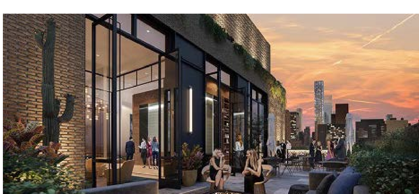
10 Grand Central Station

Just steps from Grand Central Station, 10 Grand Central Station has undergone an extensive renovation, incorporating state-of-the-art technology and comforts to meet the demands of growing businesses.